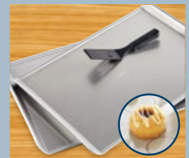
Cookie Sheet Set $46-$0 $18.60 #SN16 RASPBERRY GEMS

Note: The February host special is available to hosts of February shows of at least $200 in guest sales (before tax and shipping). To qualify for the February host special, shows must be held February 1- 29 and submitted to the home office no later than 11:59 p.m. CT on March 15, 2016. Hosts may select ONE February host special item at 60% off.