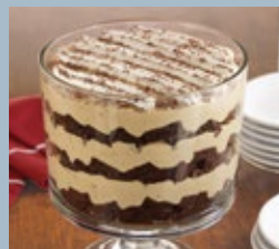
Trifle Bowl $50-$0 $20.20 #SN15 TIRAMISU BROWNIE TRIFLE