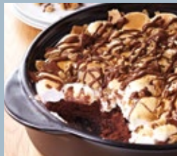
Rockcrok® Everyday Pan $119 $47.60 S'MORE CAKE