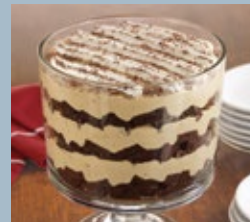
Trifle Bowl $41 $16.40 TIRAMISU BROWNIE TRIFLE