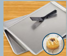
Cookie Sheet Set $38 $15.20 RASPBERRY GEMS

Note: The February host special is available to hosts of February shows of at least $200 in guest sales (before tax and shipping). To qualify for the February host special, shows must be held February 1- 29 and submitted to the home office no later than 11:59 p.m. CT on March 15, 2016. Hosts may select ONE February host special item at 60% off.